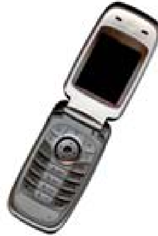
Fig. 2. Example of an unacceptable low-resolution image