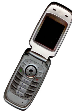
Fig. 3. Example of an image with acceptable resolution